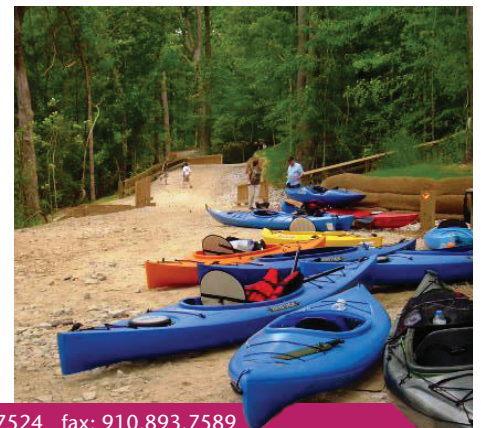
BELOW: Twenty-one kayakers made the inaugural paddle trail trip to the park during the event. They, too, were impressed by the transformation of the riverbank.