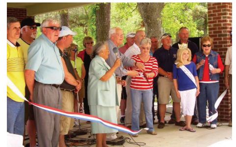
ABOVE: Close to 2,000 people attended the River Park ribbon cutting in May. Visitors along the trails described the new park as "impressive," "beautiful," and "a great place for church events and family reunions."

Harnett Co. residents and people from across the state were on hand this month for the grand opening of the new River Park in Erwin. Event-goers were wowed by the transformation of the land donated by HFTC along the Cape Fear River, at Hwy. 217 in Erwin.